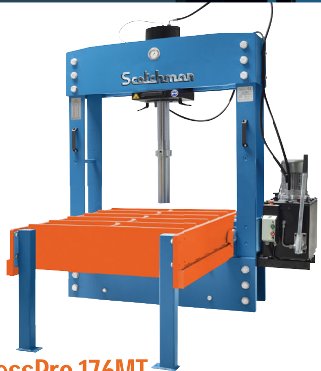
PressPro 176MT 176 ton with movable frame