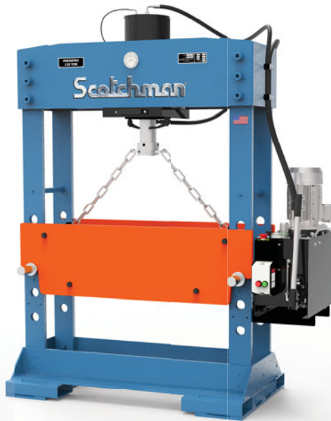
PressPro 110 110 ton