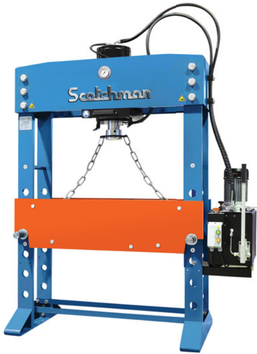
PressPro 176 176 ton