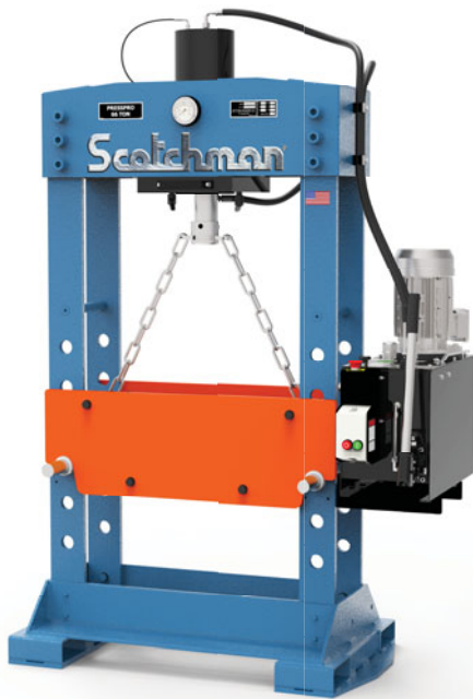
PressPro 66 66 ton